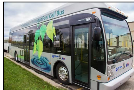
MTA Transit Vehicle

The MTA, as the agency authorized to provide public transportation services in Flint and Genesee County, operates thirteen primary Fixed Routes seven days a week, except national holidays. Monday - Friday, service operates from 6:30 a.m. to 6:30 p.m., on 1/2-hour headways, and from 6:30 p.m. to 10:00 p.m. on one (1) hour headways. On Saturdays, the 13 primary fixed routes operate from 6:30