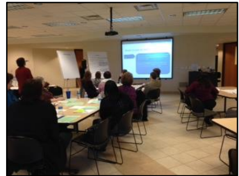
Coordinated Workshop 2014

There are many unmet needs and gaps in services in Genesee County at this time. The three groups at the Coordinated Plan Workshop re-identified unmet needs and gaps in services. Staff took all these identified needs and created a narrative that combines the needs into general categories; refer to page 20 of the Technical Report.