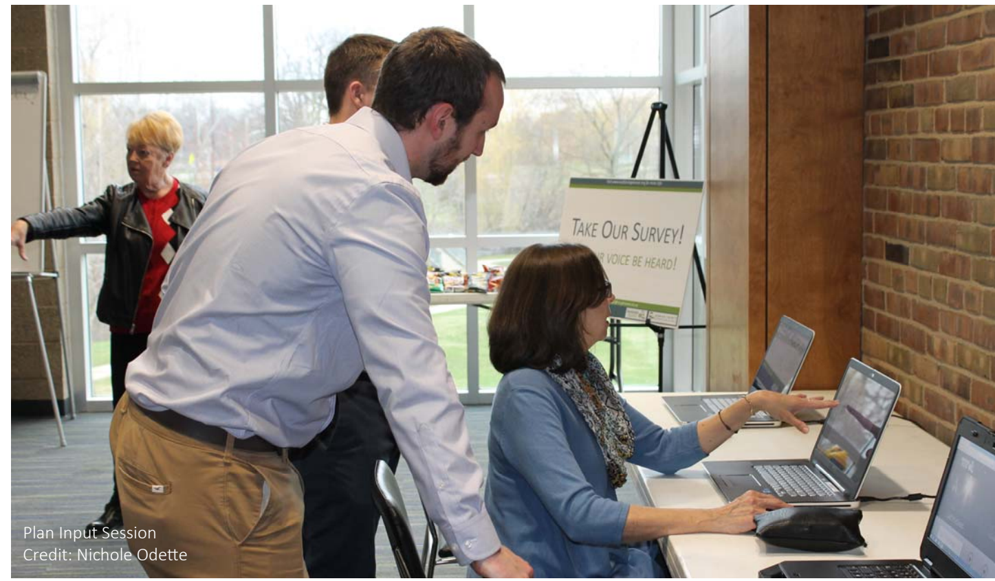
Plan Input Session

Establishing a plan that lays the foundation for future growth could not be possible without the public's ideas. The people who live, work, and play in Genesee County know what is being done well and where challenges exist. Considering this, an extensive public engagement process has been essential to plan development. Staff made a deliberate effort to be creative in building interest in the plan. Through awarding beautification grants to communities who completed the most surveys and designing a standalone website ( www.ourfuturegenesee.org ) with an interactive mapping application, voices from all over Genesee County were heard. We provided numerous opportunities for the public to be engaged and help guide the development of Genesee: Our County, Our Future . (Figure 2-1)