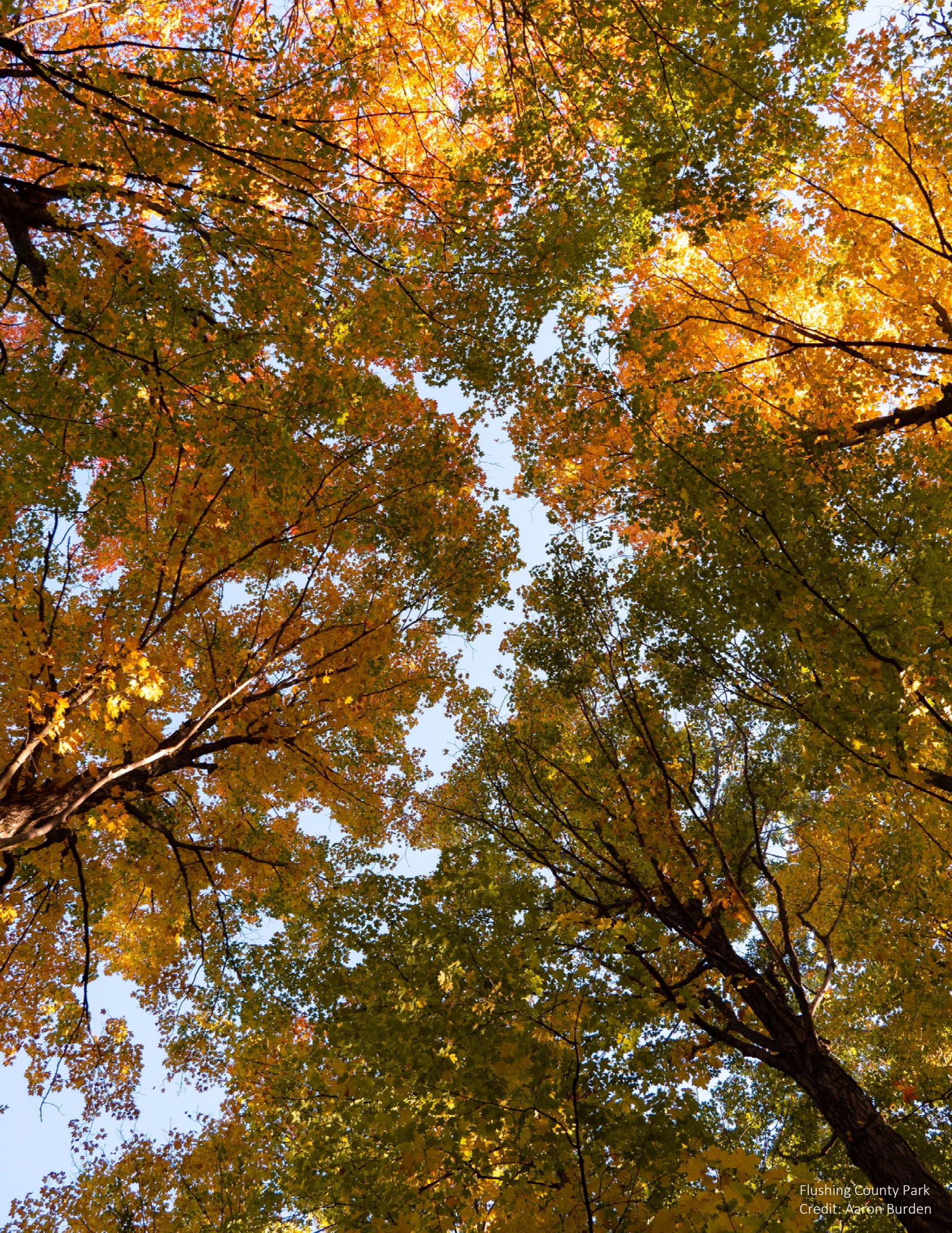
Flushing County Park