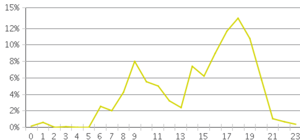
Hourly Profile during Weekdays